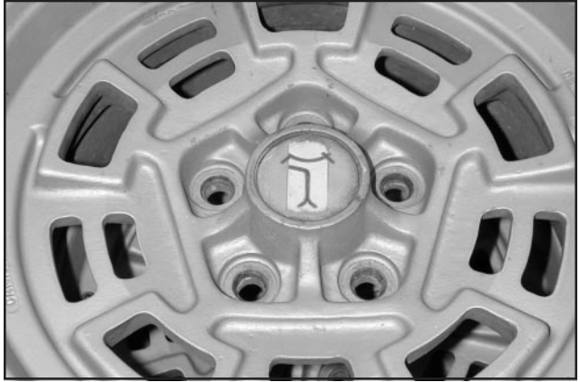
The 1971 two-slot wheel introduced profound changes. The center is identical, but the webbing has been widened slightly, and no longer reaches the top of the wheel center. The raised surfaces and the pentagon have now been given a softer, more rounded appearance