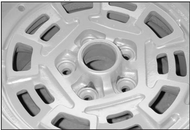
The first L-model wheel brought a return to some original design themes. The hub was strengthened even further, and the webbing was increased in size yet again. The pentagon is now flat, but the raised surfaces still retain a rounded contour