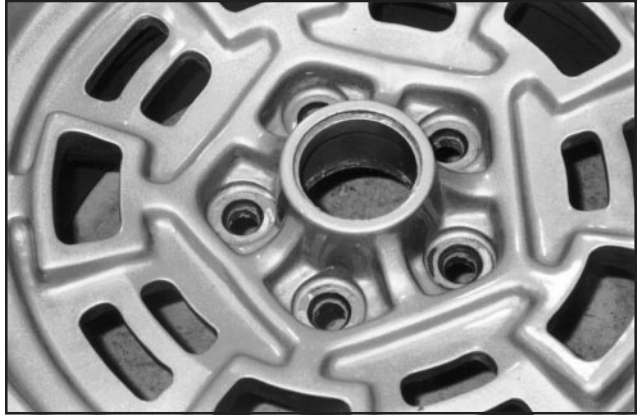
The 1972 Pre-L two-slot wheel changed yet again. The hub has been enlarged, requiring small reliefs to allow lug wrench clearance. The webbing has also been widened slightly, and the raised surfaces and the pentagon have now been raised from the face of the wheel and are slightly taller