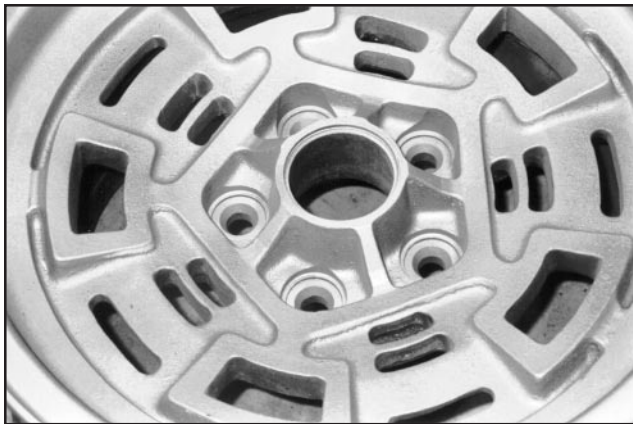
The three-slot wheel was never used on Panteras exported to the USA, and was only found on the very earliest European cars. Publicity photos of prototype Panteras show these wheels, but they were virtually never seen on cars sold to customers. The features are very sharp and crisp