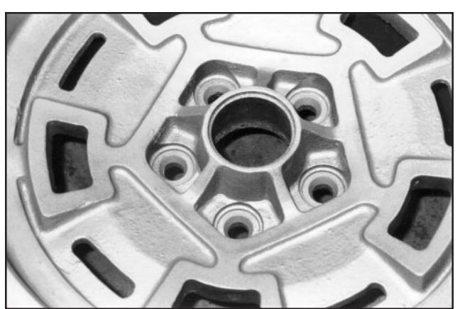
The one-slot wheel is identical to the three-slot wheel save for the lack of the two inner slots. The wheel center is rather modest, with narrow webbing connecting it with the pentagon. Both the pentagon and the raised surfaces containing the larger holes have a flat, machined appearance